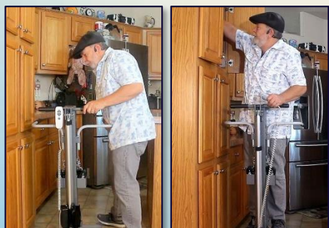
Standing Function: Reaching a Tall Cabinet