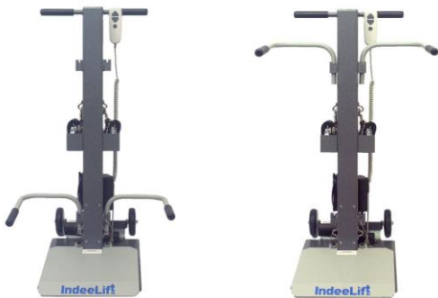
Removable Rise-Assist Handles

The Floor-To-Stand (HFL-FTS) is a lift & transfer tool that enables safe patient handling by eliminating manual patient lifting in a variety of situations. The FTS raises individuals to a standing position from any practical location one might sit; wheelchair, commode, couch, bed, or even the floor!