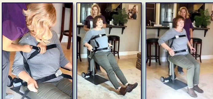
Dual Belt Assemblies for Additional Safety