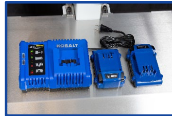
Lithium-Ion Battery Pack